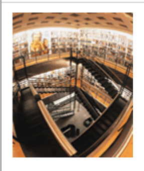
The ArtDaily Library