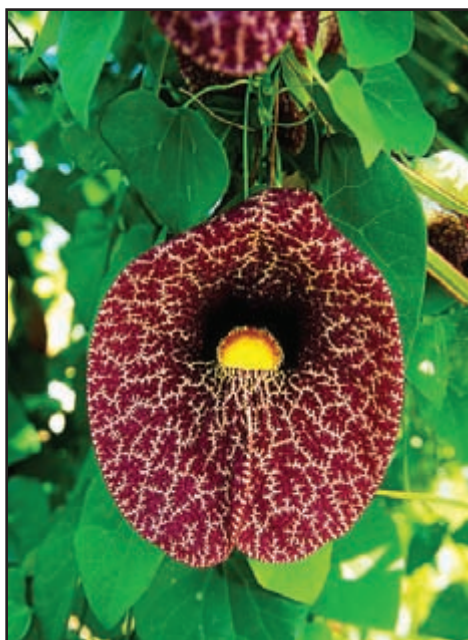
“Nature by Design,” up close and personal with a Dutchman’s pipe blossom at Naples Botanical Garden.