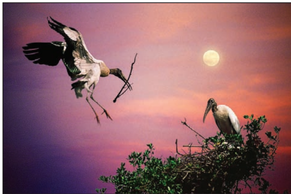
"Mission in the Moonlight," wood storks in the Ten Thousand Islands

ers are Big Cypress Swamp and Naples Botanical Garden. "Violet is the Night" is a breathtaking panoramic view in Big Cypress — one of many stunning long views and middle range views.