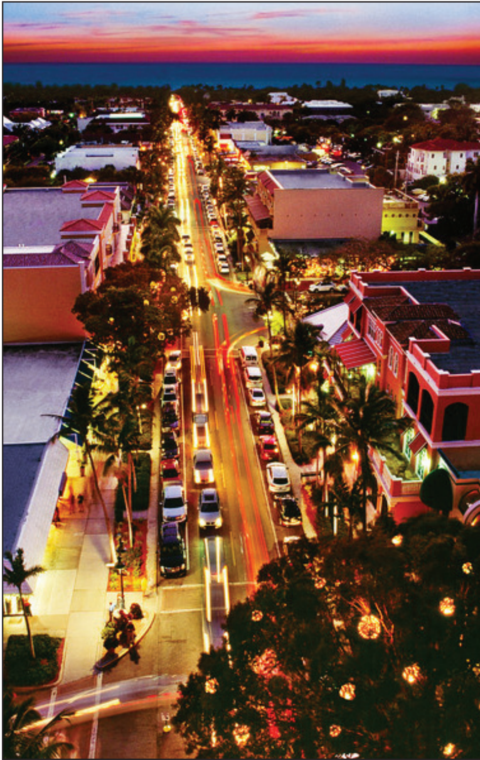
“Fifth Avenue Overview,” a familiar place from a new angle.

Portrait,” and “The Sea Islands of South Carolina, Georgia, and Florida.” She has written the text for collections by several other photographers, and she is the author of “A Kids Guide to Chicago.”