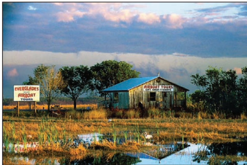
"In Time Passing," a touch of Old Florida on the Tamiami Trail.