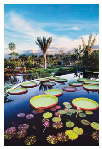
GARDEN OF DREAMS