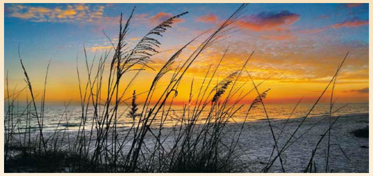
SEA OF DREAMS 1

TITLE: Journey Through Paradise - Naples, Marco Island & The Everglades