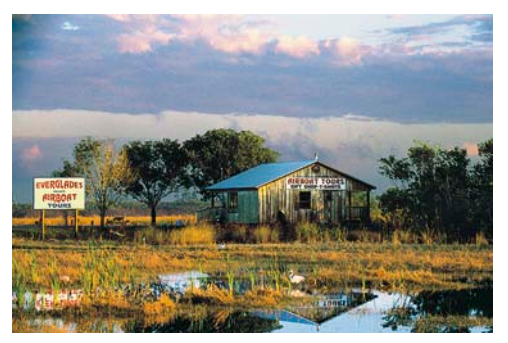
IN TIME PASSING

Journey Through Paradise is also ideal for special occasions, corporate incentives, openings, meetings and conventions, guest amenities, and donor thank-you's.